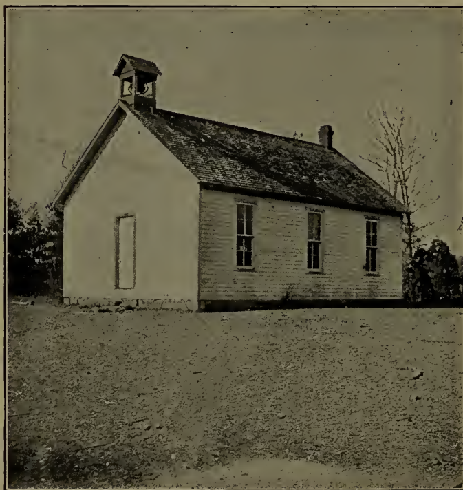
"ROCKY, GRASSLESS, TREELESS, FLOWERLESS."